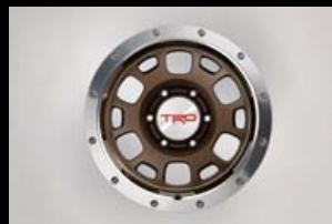
TRD 16-in. off-road beadlock wheels (black or bronze)