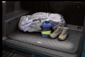
All-weather cargo mat