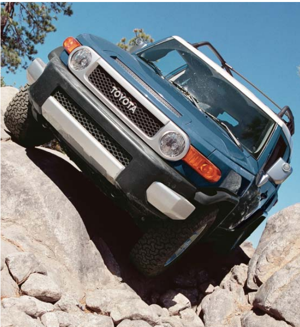
FJ Cruiser shown in Cavalry Blue with available Upgrade Package and accessory roof rack. Off-roading is inherently risky. Please use caution.