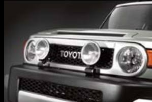
Auxiliary driving lights