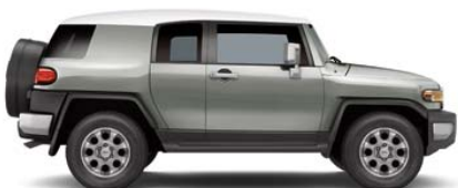
SILVER FRESCO METALLIC