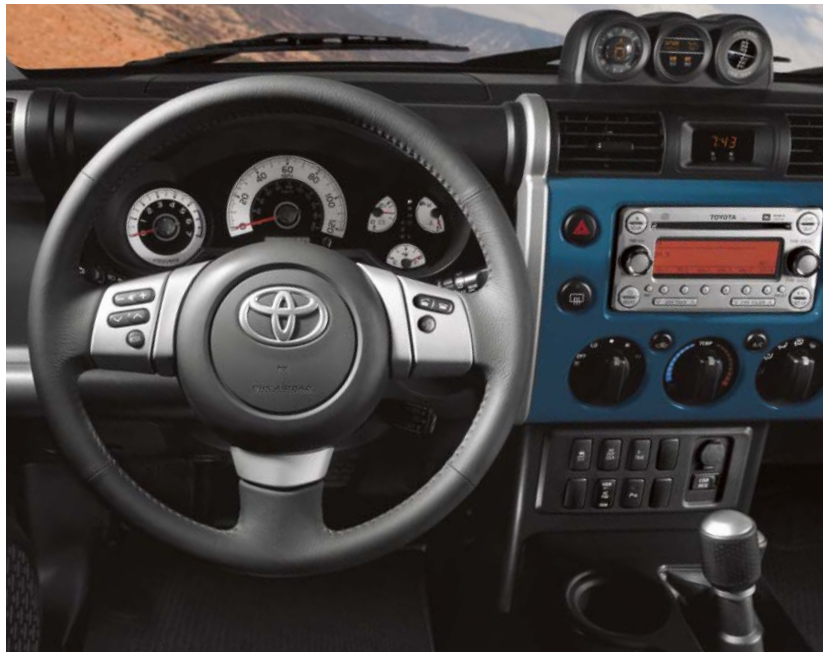
FJ Cruiser interior shown with available Upgrade Package.

The FJ Cruiser engineering standards are written in stone. That's because, after five decades of off-road experience, Toyota knows exactly what makes a vehicle capable and durable. Like the 260-hp 4.0L V6 engine, available Active Traction Control (A-TRAC) and electronically controlled locking rear differential, three standard skid plates and sturdy body-on-frame construction. Put it this way: On rocks, it rocks. The 2011 FJ Cruiser. Moving Forward.