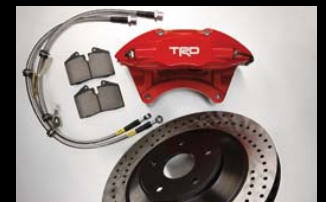
TRD performance brake kit