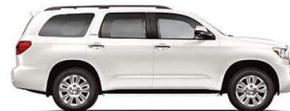
BLIZZARD PEARL 1,2 Graphite, Red Rock 1 or Sand Beige interior