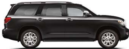
BLACK Graphite, Red Rock 1 or Sand Beige interior

Sequoia offers eight exterior colors to choose from — easy to remember since it also offers available seating for eight. And each exterior color offers two or three interior colors to match. Decisions, decisions.