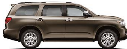
PYRITE MICA Graphite, Red Rock 1 or Sand Beige interior