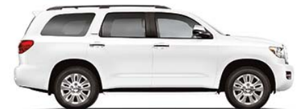
SUPER WHITE 3 Graphite or Sand Beige interior