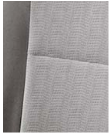
SR5 fabric in Graphite