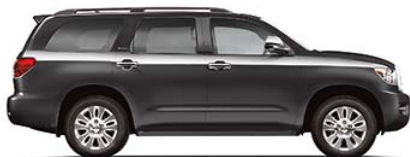
MAGNETIC GRAY METALLIC Graphite or Red Rock 1 interior