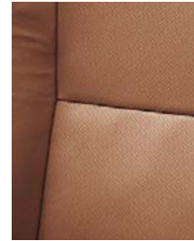
Platinum perforated leather in Red Rock