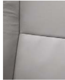
Limited leather in Graphite