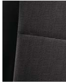
SR5 Sport fabric in Black