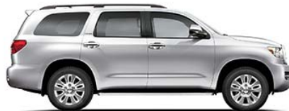
SILVER SKY METALLIC Graphite or Red Rock 1 interior