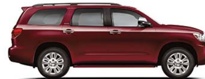
CASSIS PEARL Graphite, Red Rock 1 or Sand Beige interior