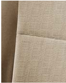
SR5 fabric in Sand Beige