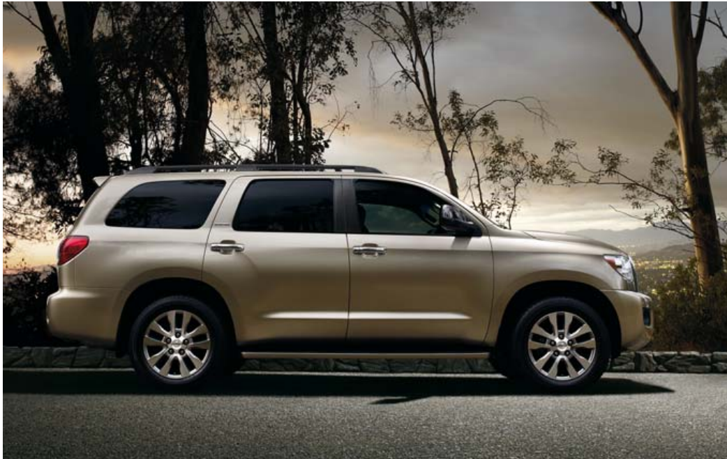
Limited 4x2 shown in Sandy Beach Metallic.