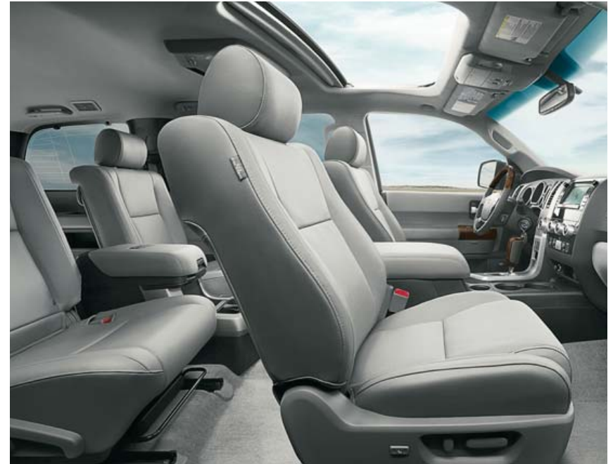
Platinum 4x4 interior shown in Graphite.

Adventure awaits in the versatile 8-passenger 1 Toyota Sequoia. Available Adaptive Variable Suspension (AVS) and Multi-Mode 4WD make it ideal both on- and off-road. There's an available power reclining and folding third-row seat. A power rear liftgate that opens to 120.1 cu. ft. of cargo space 2 . An available 7400-lb. towing capacity. 3 And the standard Star Safety System™, which lets you head out with confidence. The 2011 Toyota Sequoia. Moving Forward.