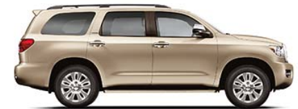
SANDY BEACH METALLIC Red Rock 1 or Sand Beige interior