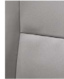
Platinum perforated leather in Graphite