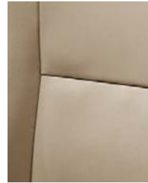
Limited leather in Sand Beige