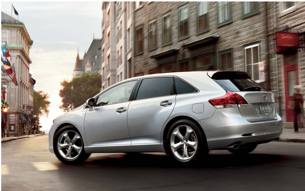
Venza V6 shown in Classic Silver Metallic with available Convenience Package.