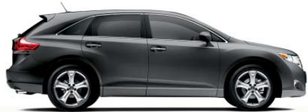
MAGNETIC GRAY METALLIC Ivory or Light Gray interior