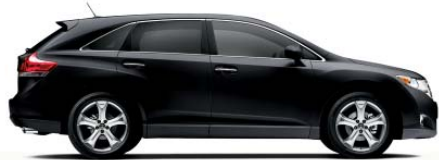
BLACK Ivory or Light Gray interior

With nine colors, it's not an easy choice. The finish of Venza is checked using laser-optic sensors that can detect minute deviations in the thickness of the paint. The result is a level of quality designed to keep Venza looking new for years to come.