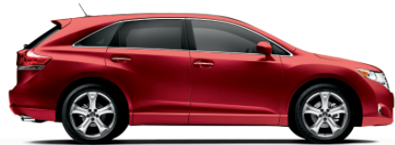
BARCELONA RED METALLIC Ivory or Light Gray interior