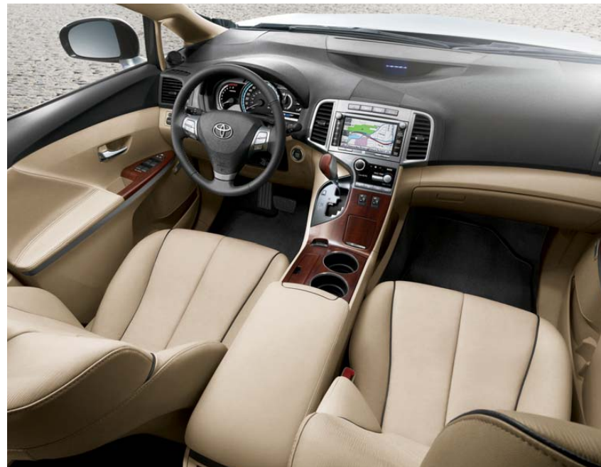
Venza interior shown in Ivory leather with available Premium Package #2 and voice-activated touch-screen DVD navigation system 1 .

Discover a new expression of driving in the Toyota Venza. Combining the performance of a sports sedan with the spaciousness of an SUV, Venza is available with All-Wheel Drive and offers you a choice of two Ultra Low Emission Vehicle II (ULEV-II) engines. Plus, it features a USB 2 port with iPod ®3 connectivity and Bluetooth ®4 wireless technology. And, as with every Toyota, our Star Safety System ™ is standard. The 2011 Toyota Venza. Moving Forward.