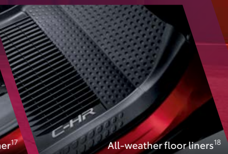
All-weather floor liners 18