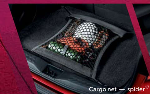
Cargo net — spider 17