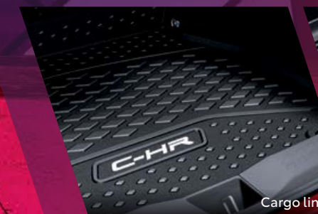
Cargo liner 17