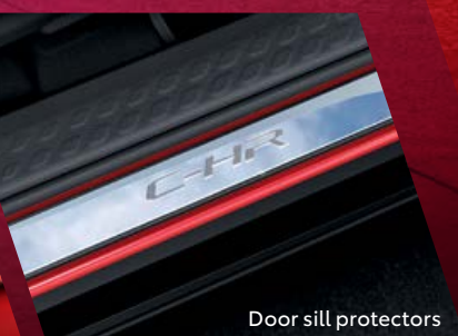
Door sill protectors