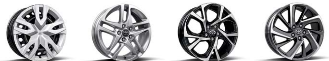
17-in. steel wheel