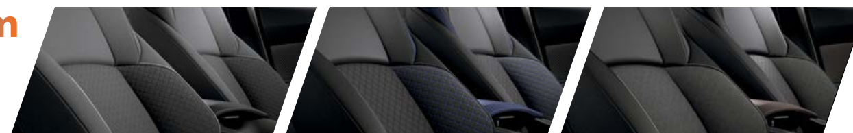
LE fabric shown in Black with Gunmetal accent