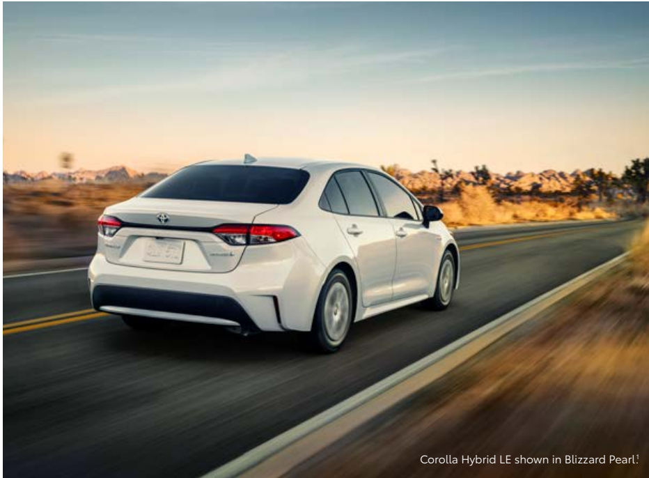
Corolla Hybrid LE shown in Blizzard Pearl. 1