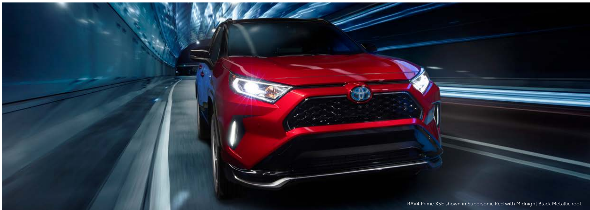
RAV4 Prime XSE shown in Supersonic Red with Midnight Black Metallic roof.