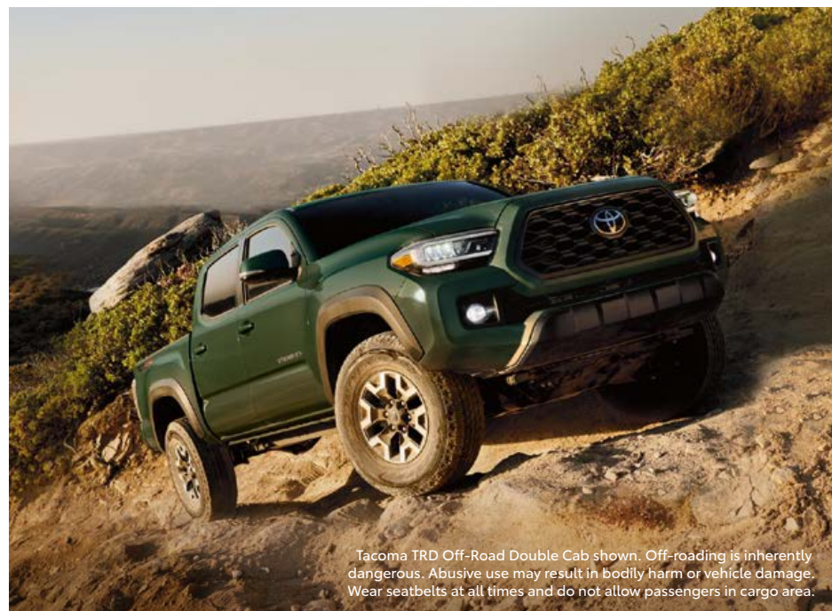
Tacoma TRD Off-Road Double Cab shown. Off-roading is inherently dangerous. Abusive use may result in bodily harm or vehicle damage. Wear seatbelts at all times and do not allow passengers in cargo area.