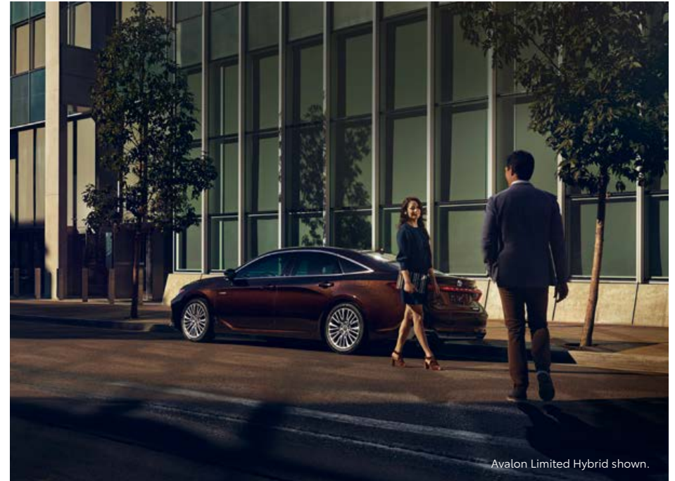
Avalon Limited Hybrid shown.

Underneath Avalon Hybrid's striking design is an impressive hybrid drivetrain and a wealth of technology that's ready to give you the most out of every drive.