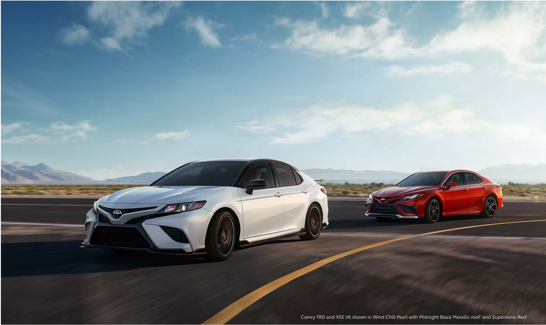
Camry TRD and XSE V6 shown in Wind Chill Pearl with Midnight Black Metallic roof 1 and Supersonic Red 1 .