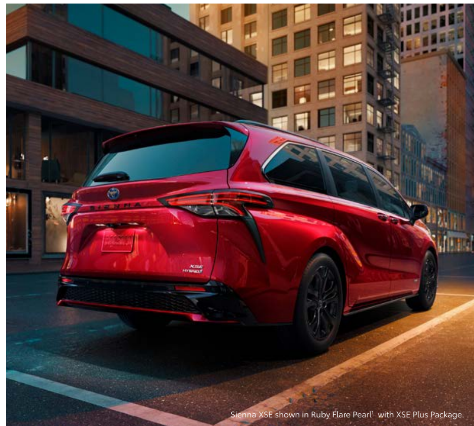
Sienna XSE shown in Ruby Flare Pearl 1 with XSE Plus Package.