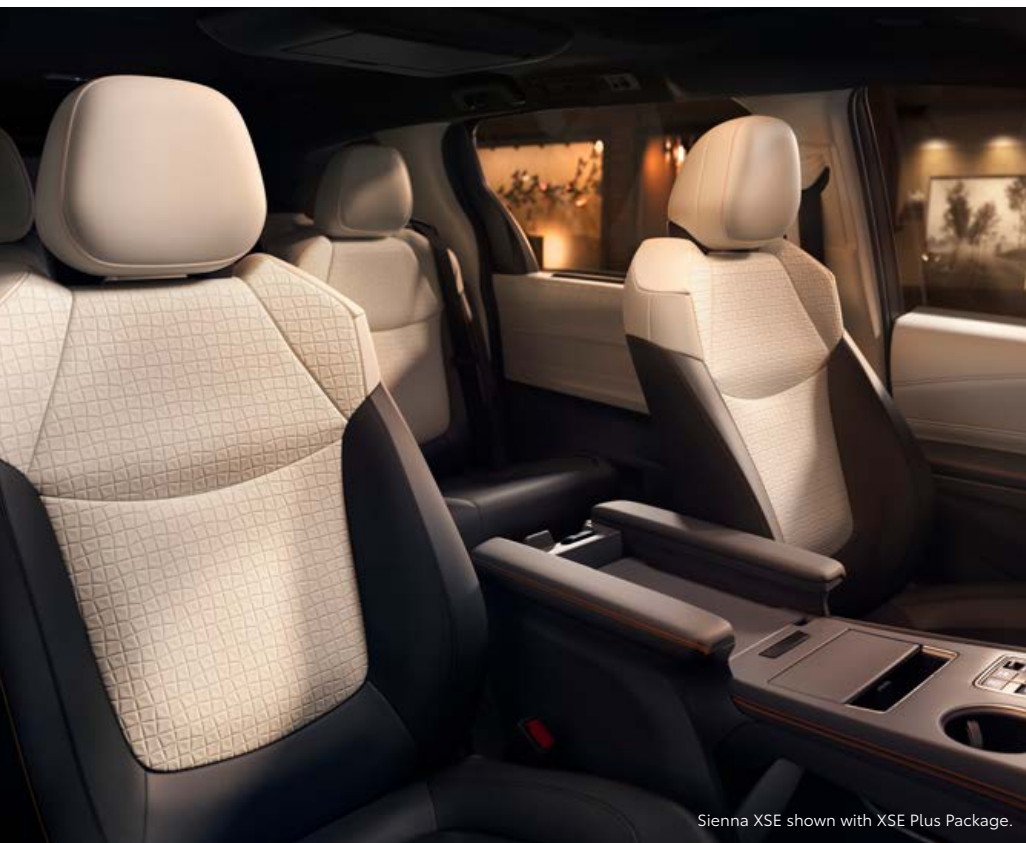
Sienna XSE shown with XSE Plus Package.