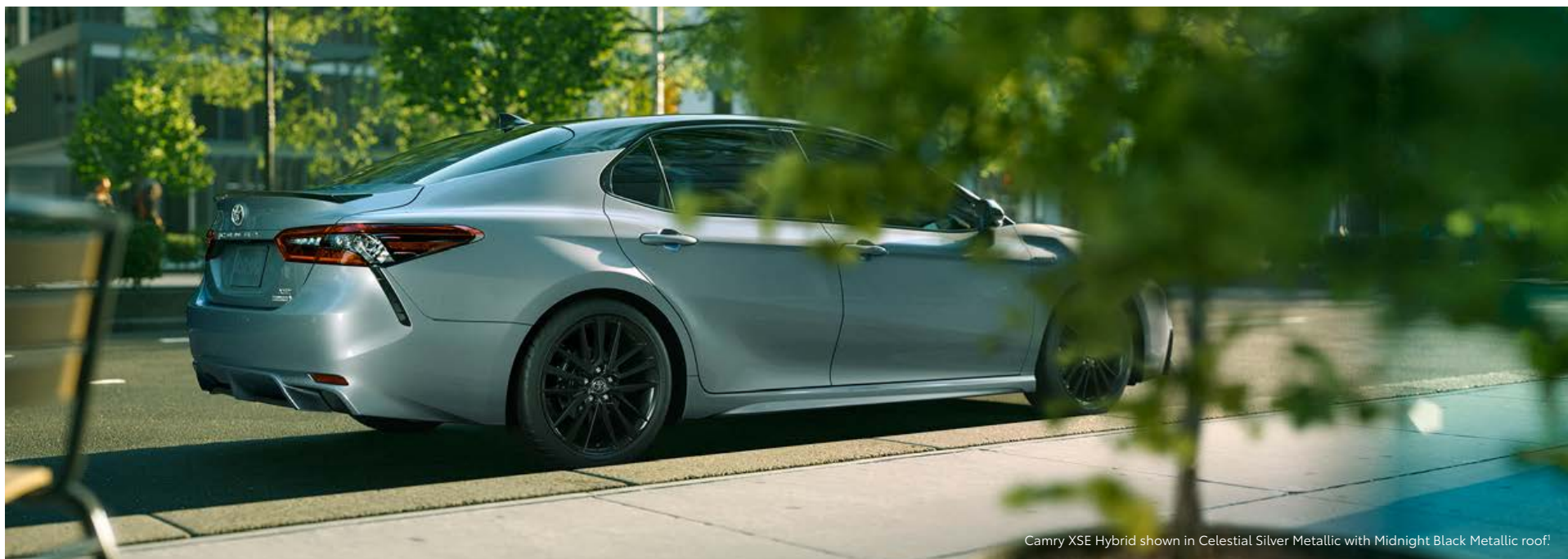
Camry XSE Hybrid shown in Celestial Silver Metallic with Midnight Black Metallic roof. 1