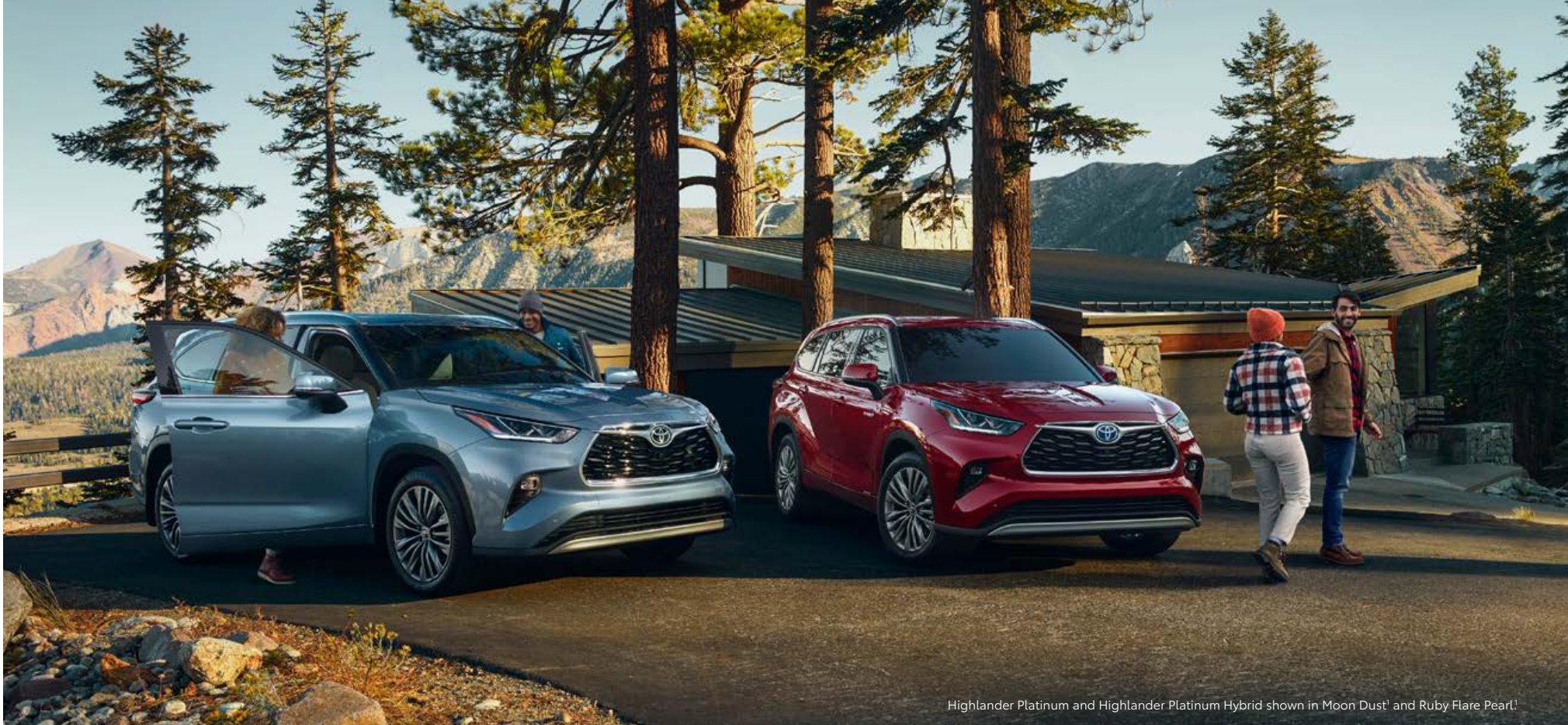
Highlander Platinum and Highlander Platinum Hybrid shown in Moon Dust 1 and Ruby Flare Pearl 1 .