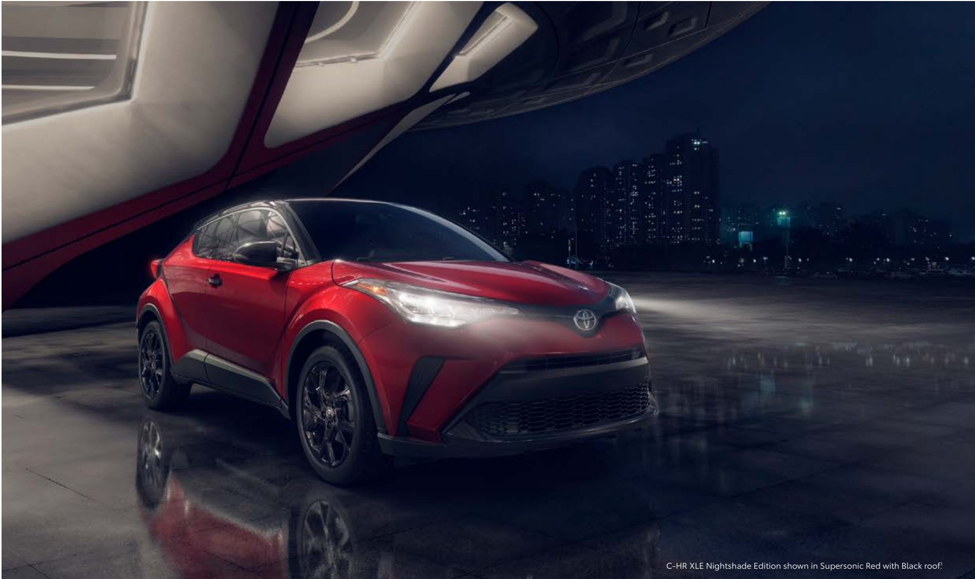
C-HR XLE Nightshade Edition shown in Supersonic Red with Black roof.*