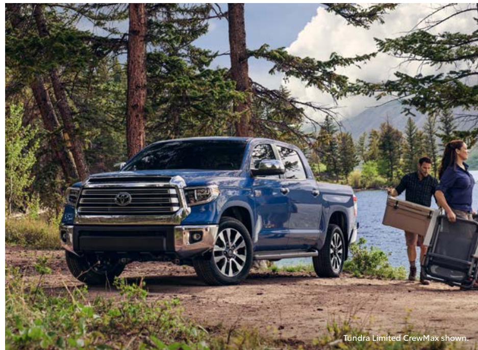
Tundra Limited CrewMax shown.

Tacoma and Tundra are built to climb hills and run long. Play harder than ever before with a truck capable of conquering the earth.