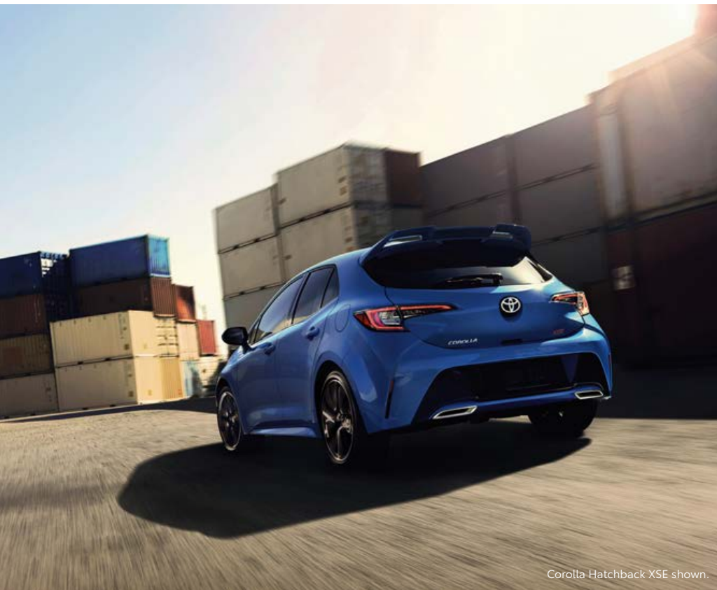
Corolla Hatchback XSE shown.