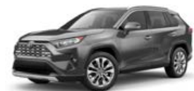
CROSSOVERS & SUVs