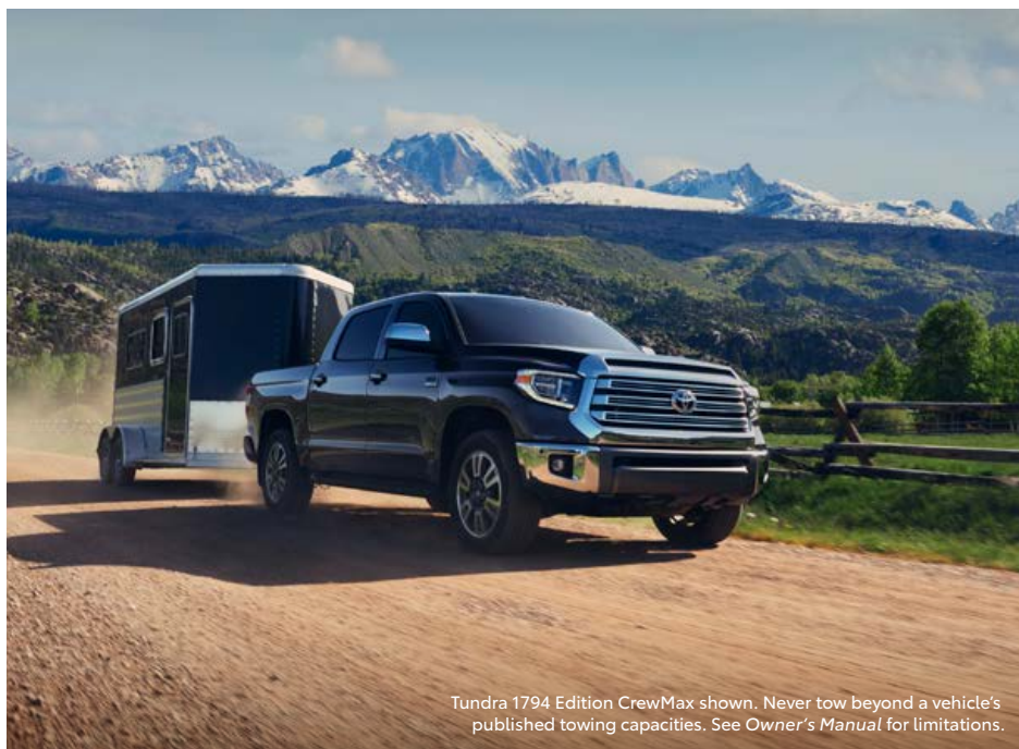
Tundra 1794 Edition CrewMax shown. Never tow beyond a vehicle's published towing capacities. See Owner's Manual for limitations.