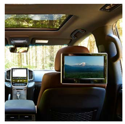
See numbered footnotes in Disclosures section.