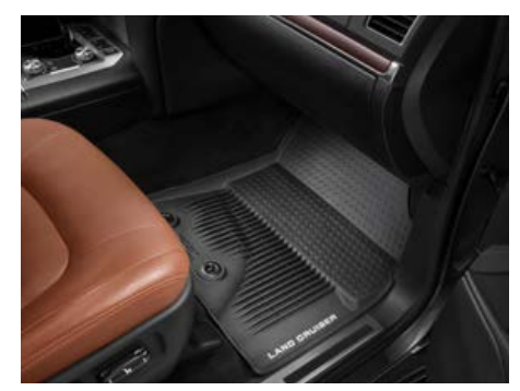
All-weather floor mats<sup>21</sup>

This is a great way to add extra personality to your Land Cruiser. Not every accessory is available in your area, so for a complete list of accessories, go to toyota.com/landcruiser/accessories.