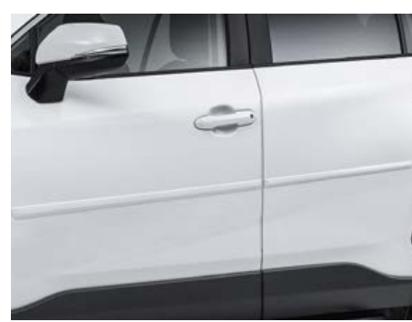
Body side moldings