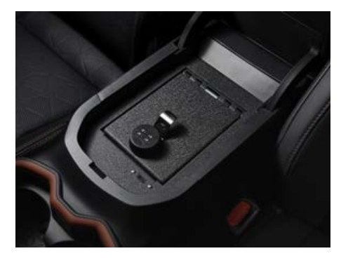
In-vehicle safe by Console Vault®

This is a great way to add extra personality to your RAV4. Not every accessory is available in your area, so for a complete list of accessories, go to toyota.com/rav4/accessories.