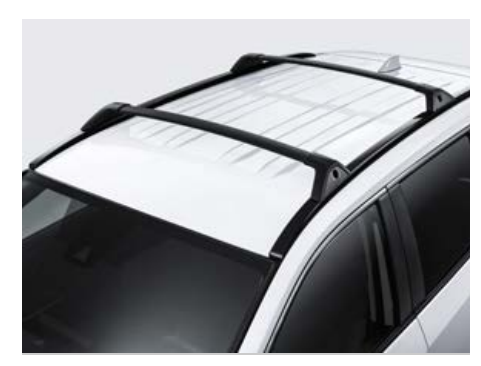
Roof rack cross bars