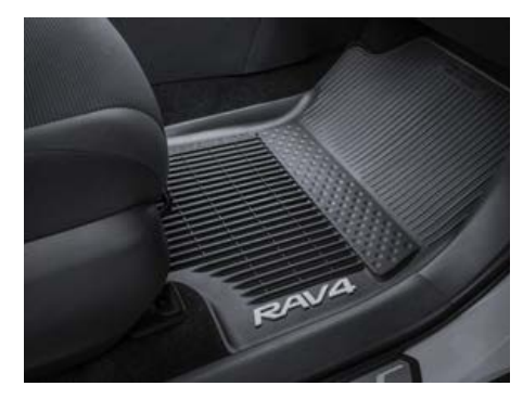
All-weather floor liners<sup>43</sup>