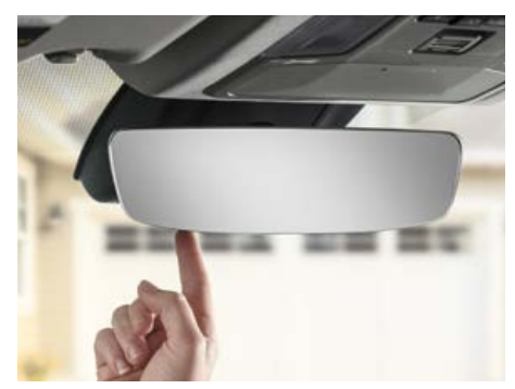
Frameless HomeLink®39 mirror