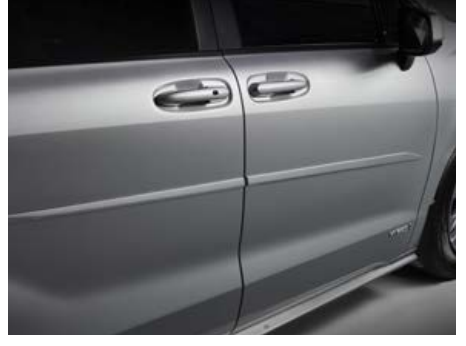
Body side moldings