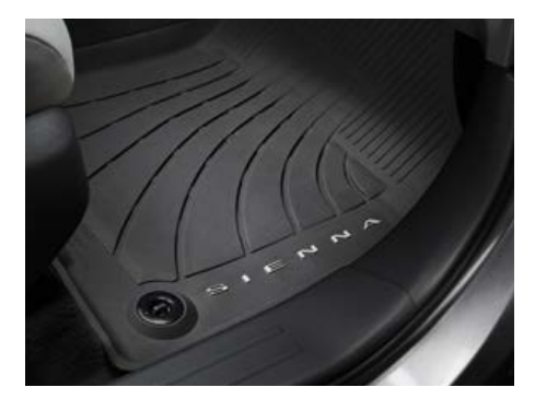
All-weather floor liner<sup>45</sup>

This is a great way to add extra personality to your Sienna. Not every accessory is available in your area, so for a complete list of accessories, go to toyota.com/sienna/accessories.