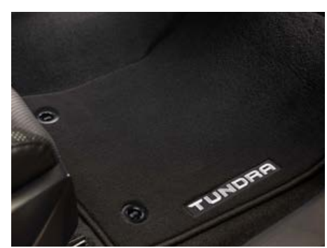
Carpet floor mats<sup>46</sup>