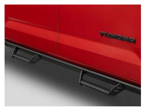
Predator tube step