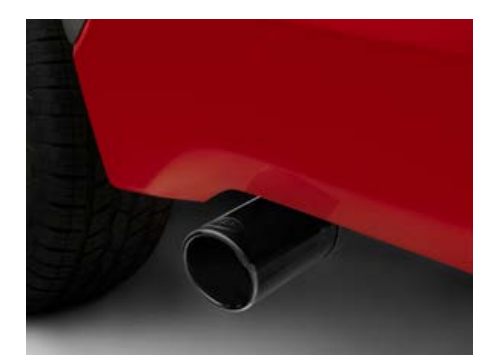
Exhaust tips — black or chrome

This is a great way to add extra personality to your Tundra. Not every accessory is available in your area, so for a complete list of accessories, go to toyota.com/tundra/accessories.