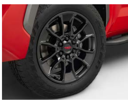
TRD Off-Road: 20-in. black alloy wheels