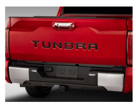
Tailgate insert — black or chrome