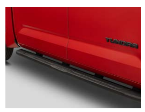
TRD cast-aluminum running boards