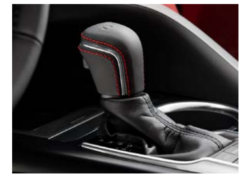
TRD shift knob