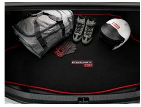
TRD carpet trunk mat