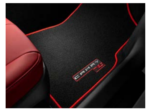
TRD carpet floor mats<sup>43</sup>