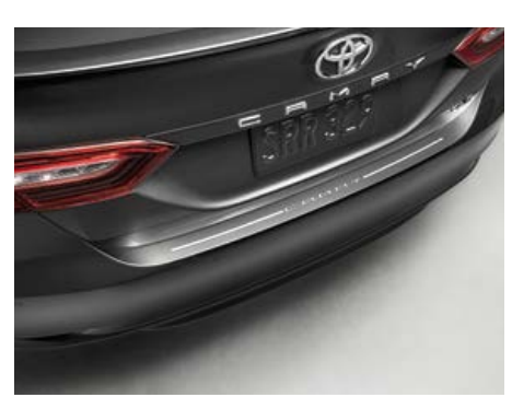
Rear bumper appliqué