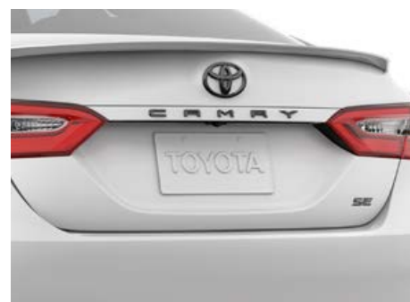
Blackout emblem overlays