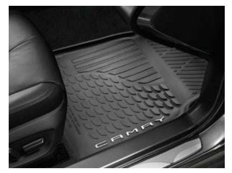
All-weather floor liners<sup>43</sup>

This is a great way to add extra personality to your Camry. Not every accessory is available in your area, so for a complete list of accessories, go to toyota.com/camry/accessories.