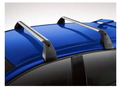
Removable cross bars<sup>55</sup>