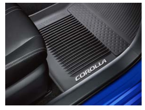
All-weather floor liners<sup>54</sup>

This is a great way to add extra personality to your Corolla Hatchback. Not every accessory is available in your area, so for a complete list of accessories, go to toyota.com/corollahatchback/accessories.