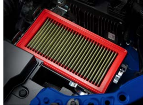
TRD air filter