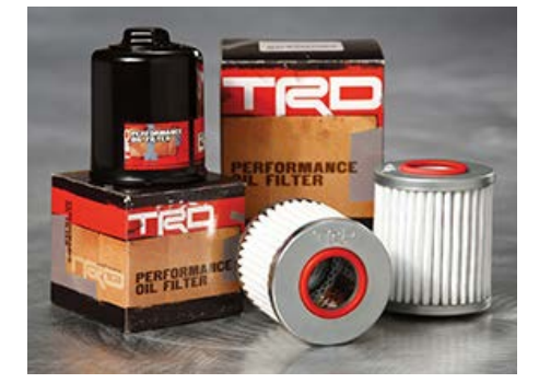
TRD oil filter