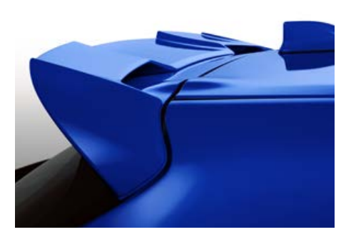
Rear window spoiler