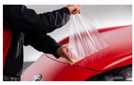
Paint protection kit<sup>37</sup>