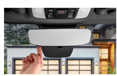
Frameless HomeLink<sup>®36</sup> mirror