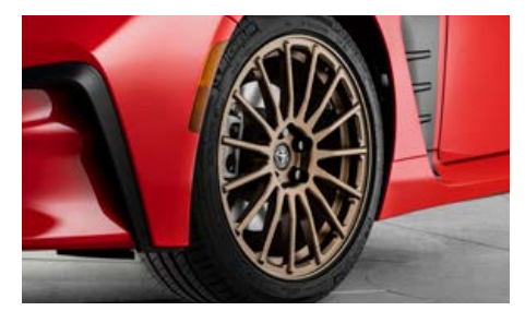
17-in. GR forged alloy wheels — bronzed colored

A wide range of Genuine Toyota Accessories is available to help make driving your GR86 even more fun. Now your GR86 can reflect your personal style. There's something for everyone. Some accessories may not be available in all regions of the country. For a complete list of accessories, go to toyota.com/gr86.