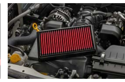
GR air filter