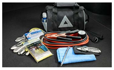
Emergency assistance kit