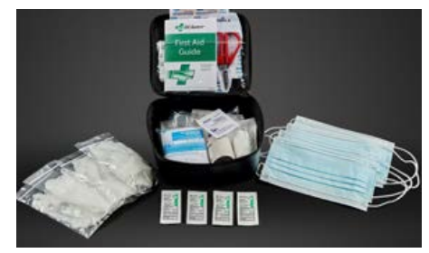
First aid kit with PPE