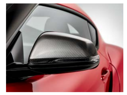
Carbon-fiber mirror caps

Add a personal touch to your GR Supra with Genuine Toyota Accessories. Some accessories may not be available in all regions of the country. See your Toyota dealer for details.