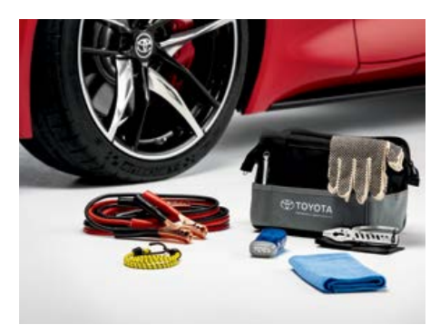
Emergency assistance kit