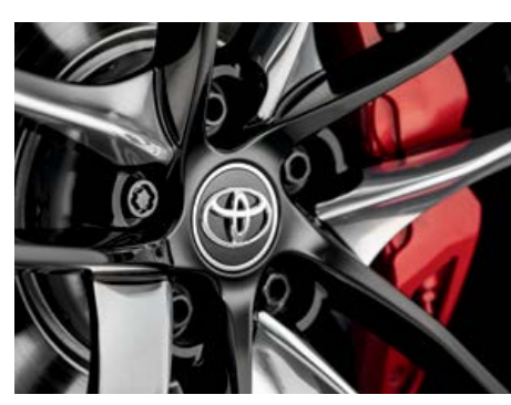
Alloy wheel locks