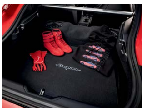
Carpet cargo mat<sup>43</sup>