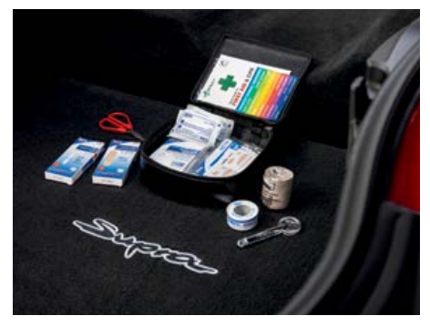
First aid kit<sup>43</sup>