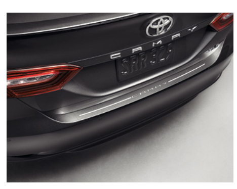
Rear bumper appliqué