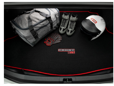
TRD carpet trunk mat