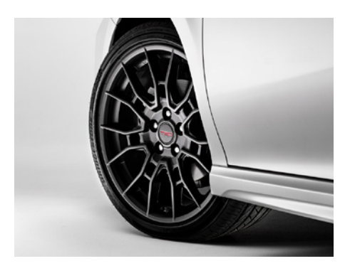
19-in. TRD matte-black alloy wheels