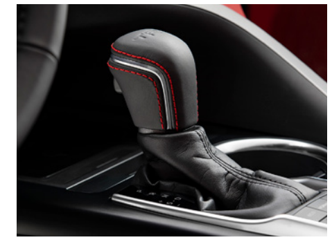
TRD shift knob