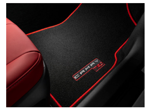
TRD carpet floor mats<sup>41</sup>