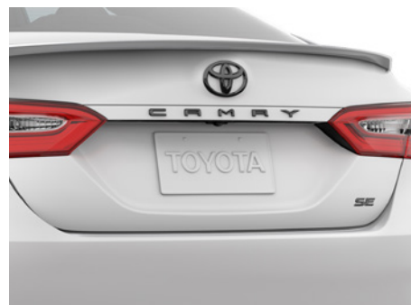
Blackout emblem overlays