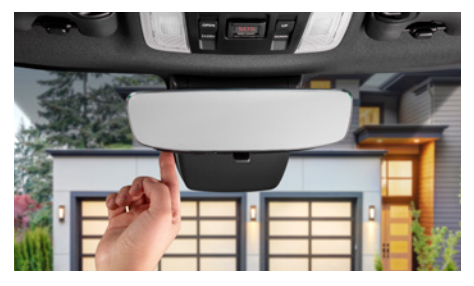
Frameless HomeLink®31 mirror