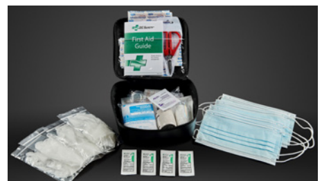
First aid kit with PPE