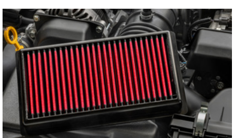
GR air filter