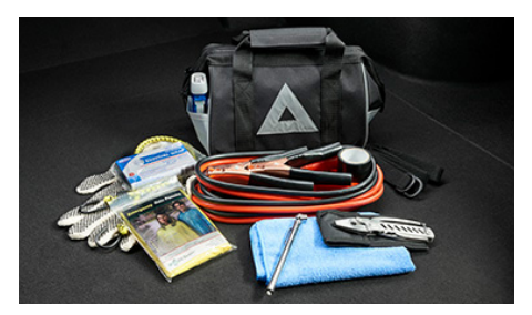
Emergency assistance kit