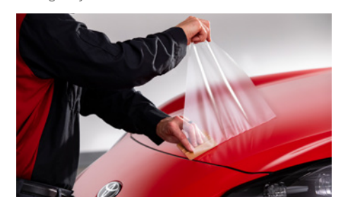
Paint protection kit<sup>32</sup>