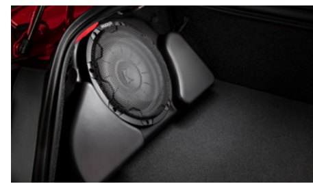
10-in. powered subwoofer