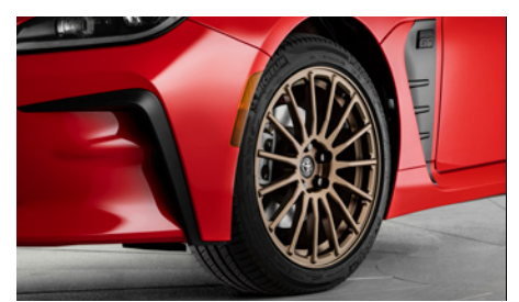
17-in. GR forged alloy wheels — bronze-colored

A wide range of Genuine Toyota Accessories is available to help make driving your GR86 even more fun. Now your GR86 can reflect your personal style. There's something for everyone. Some accessories may not be available in all regions of the country. For a complete list of accessories, go to toyota.com/gr86.