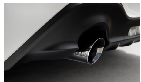
GR performance dual exhaust — chrome