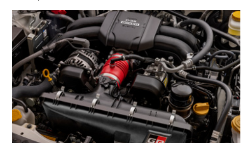
GR air intake system