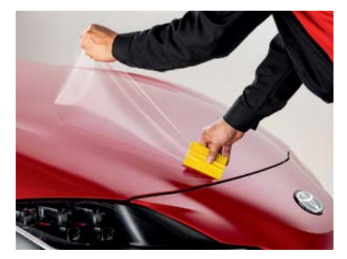
Paint protection film<sup>42</sup>