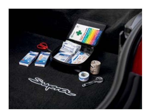
First aid kit