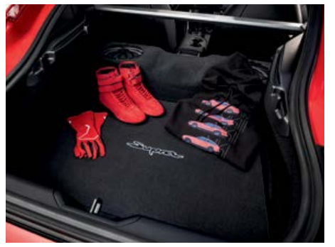
Carpet cargo mat