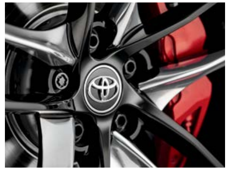
Alloy wheel locks