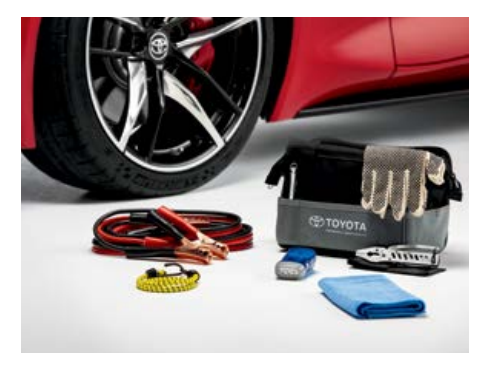
Emergency assistance kit