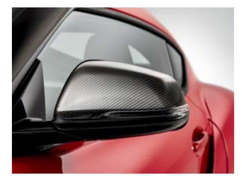
Carbon-fiber mirror caps

Add a personal touch to your GR Supra with Genuine Toyota Accessories. Some accessories may not be available in all regions of the country. See your Toyota dealer for details.