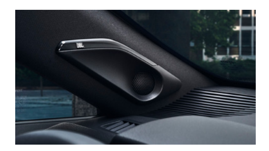
JBL® Premium Audio system

Enhance every drive with an experience that's all about you. Whether enjoying the sounds of your favorite soundtrack or interacting with an interface that comes naturally, you're always invited to set the tone for every drive.