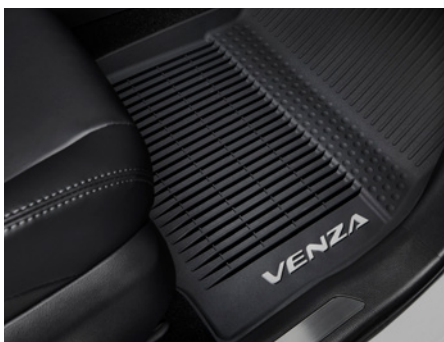
All-weather floor liners<sup>43</sup>