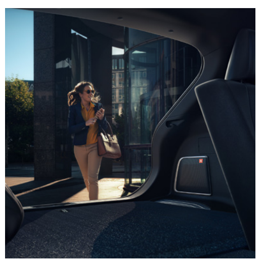
See numbered footnotes in Disclosures section.