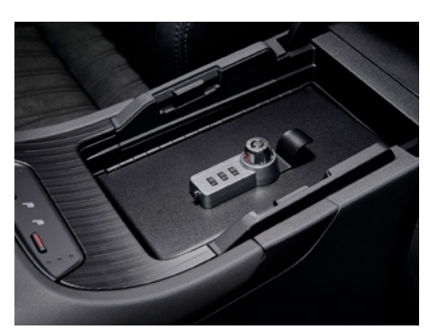
Center console safe