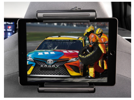
Universal tablet holder<sup>46</sup>