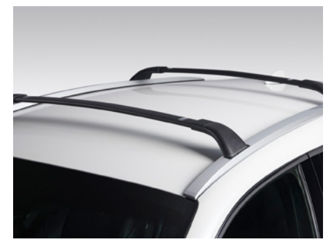
Roof rack cross bars<sup>2, 45</sup>