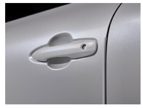
Door edge guard