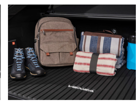
All-weather cargo tray