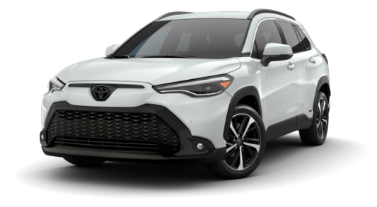
Corolla Cross Hybrid