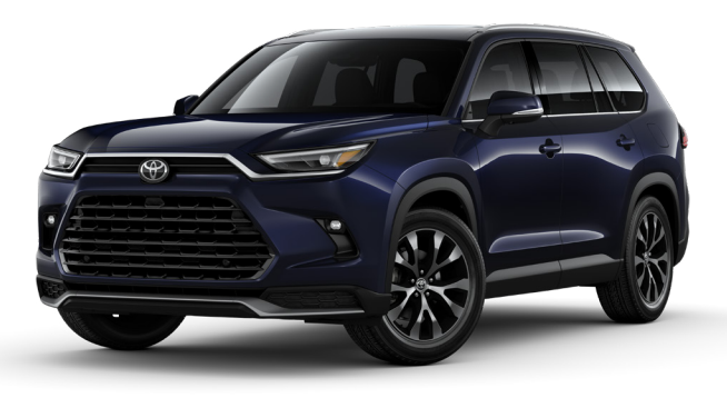
Grand Highlander Hybrid